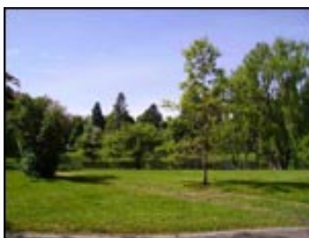
Park nearby for fun!