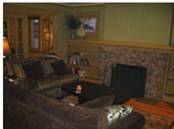
Beautiful Masonry Fireplace