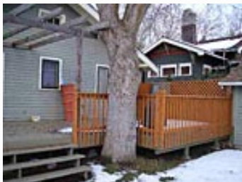
New Back Deck

SPECIAL FEATURES: Formal living room, Den or office, Wood floors, Wood window frames