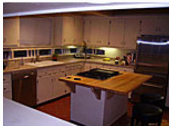
Large Remodeled Kitchen